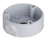
PFA135 Junction box