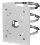
PFA150 Pole mount